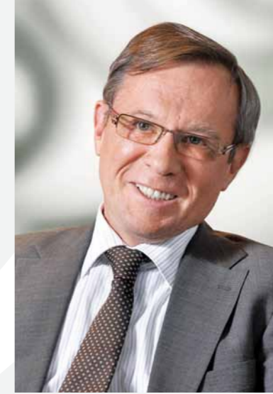
Péter Kisbenedek, President

We are still convinced that the Hungarian insurance market offers great opportunities: the per capita life insurance premium revenue is on average ten times higher, but even the non-life insurance premium revenues are also at least four times as high as they are in Hungary. It is in the interest of the whole economy to enable the sector to start growing already in 2012, primarily by reducing the underinsuredness of the SME and retail sector and by properly regulating health insurance. I wish to be optimistic and hope that I will be able to report on the first results of those endeavours in next year's presidential address.